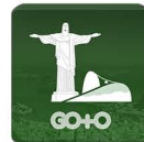
Rio de Janeiro

Visit gototravelguides.net/rio or search for "Go To Rio" on the App Store or Google Play