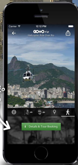
photo guide: we send users to your website to book tours, restaurants, hotels & flights